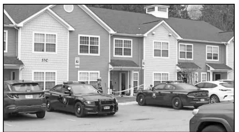
A teenage boy was killed and his teenage brother, and mom, were wounded during a shooting that took place in an apartment complex on Route 6 in Baldwin Place on Oct. 28.

"A spokesperson for Westchester County insisted that 'we