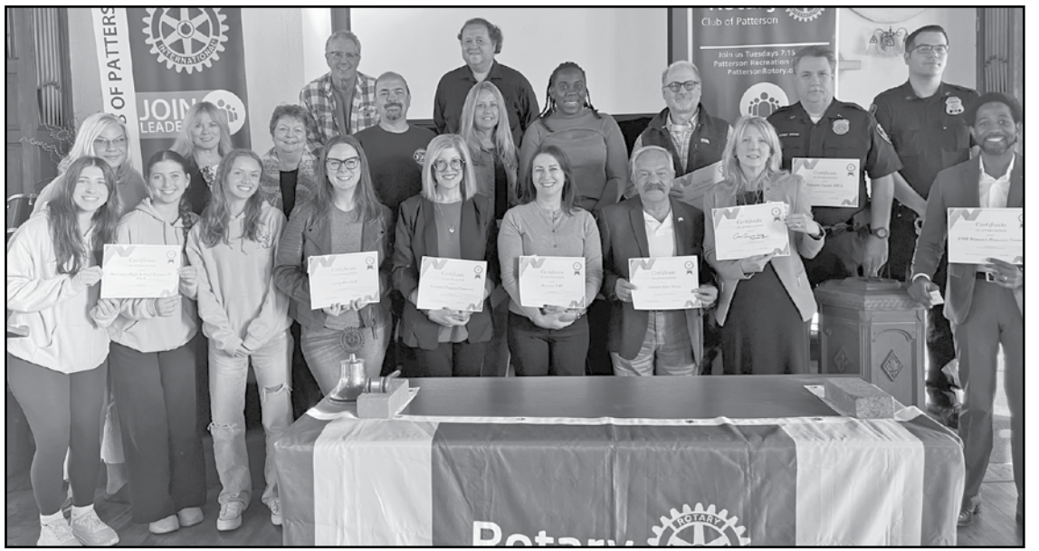
Dozens of local charitable organizations benefited from the generosity of the Patterson Rotary during its recent annual giveaway.

Field Hall Foundation's mission is to improve the lives of older adults and their caregivers in Westchester, Putnam and Dutchess counties, by providing grants to nonprofits and local government agencies for programs and projects that directly impact vulnerable seniors and/or their caregivers, with priority given to programs that address their basic needs.