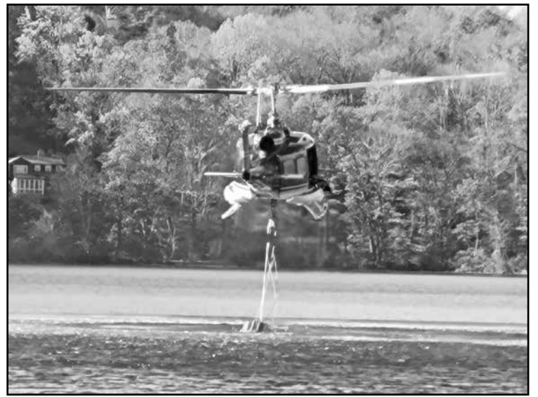
Above: A New York State Police helicopter fills up with water that was used to douse the flames in the Kent brush fire.