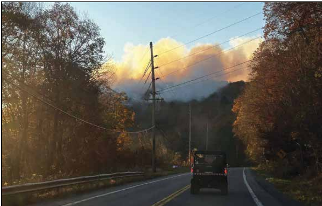
Smoke could be seen on the mountain during the large brush fire near the Sedgewood Club property in Kent that burned 33 acres Oct. 22 to 28.

After a 12-hour search, an astute business owner in Putnam Continued on Page 10