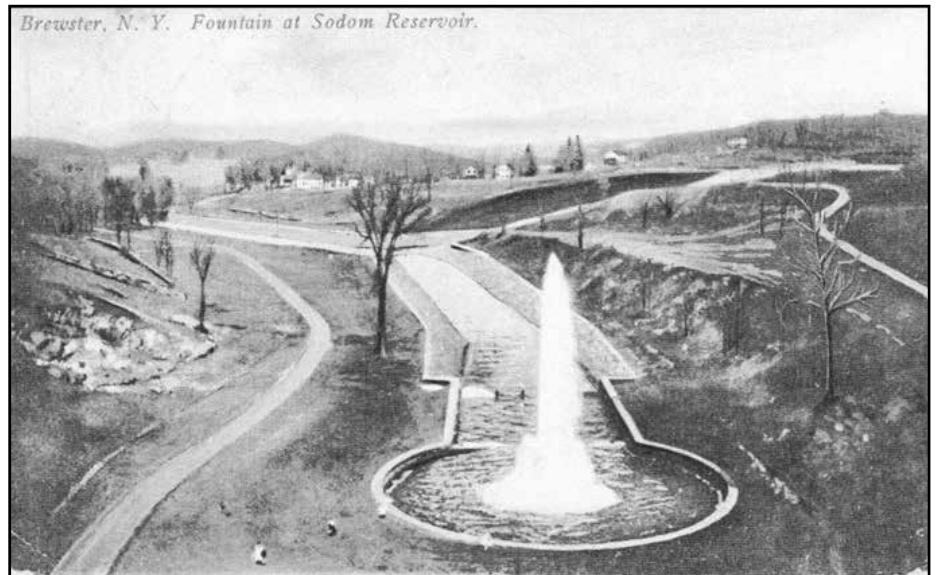
Above: A postcard featuring the aeration fountain at East Branch (Sodom) Reservoir in Brewster/Southeast circa 1910, from the HC556 Denis M. Castelli Collection at the Putnam County Historian's Office.