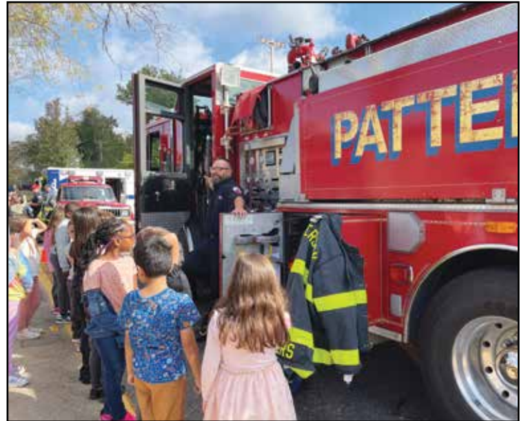
Firefighters, EMTs and other first-responders from Patterson Fire Department visited Carmel elementary students recently.