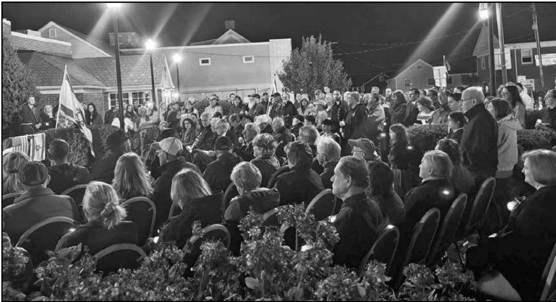
More than 200 people attended a candlelight vigil at Spain Cornerstone Park in Carmel, hosted by Chabad of Putnam, to mark the anniversary of the Oct. 7, 2023, Hamas attack in Israel. Attendees prayed for the individuals killed that day and since, as well as those still held hostage by the terrorist group.