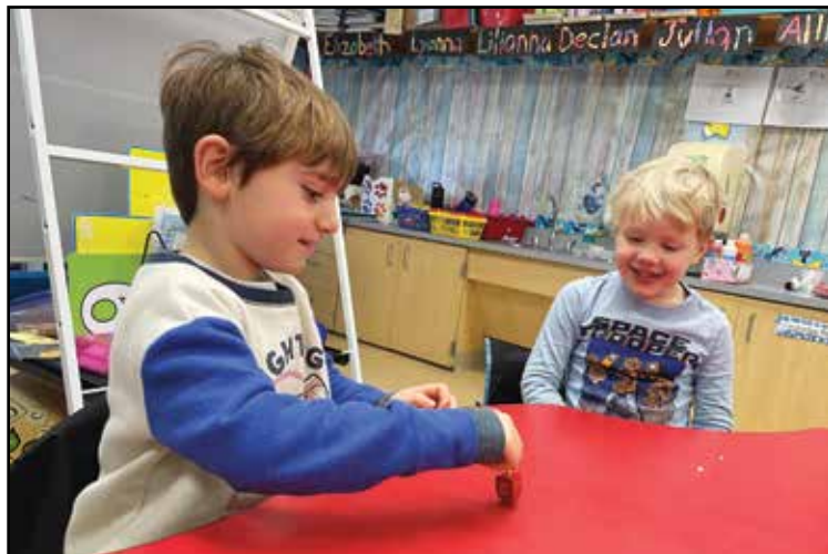
Right: Students learn to spin a dreidel.