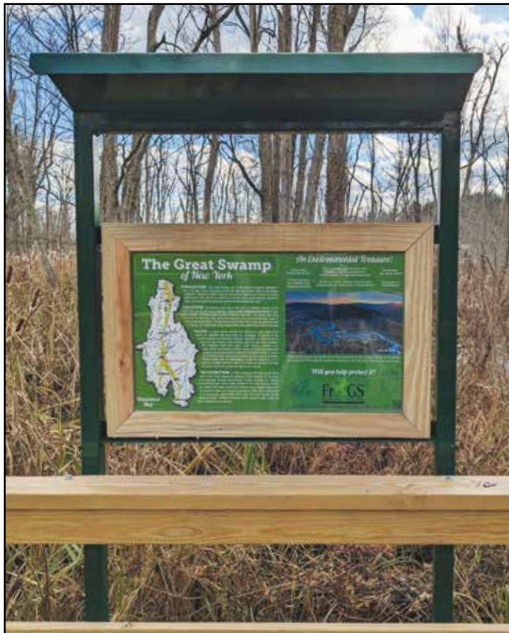
The new sign encourages visitors to appreciate the value of the Great Swamp.