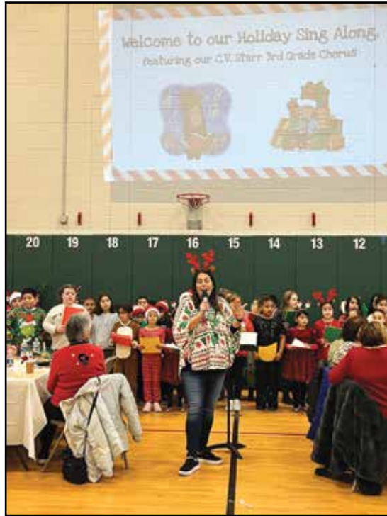
Brewster middle-school students recently served up a festive lunch for senior citizens.

C.V. Starr Intermediate School recently hosted senior citizens from Southeast and Patterson for a special luncheon in which they were treated to a meal and serenaded by third-graders decked out in holiday colors and bling.