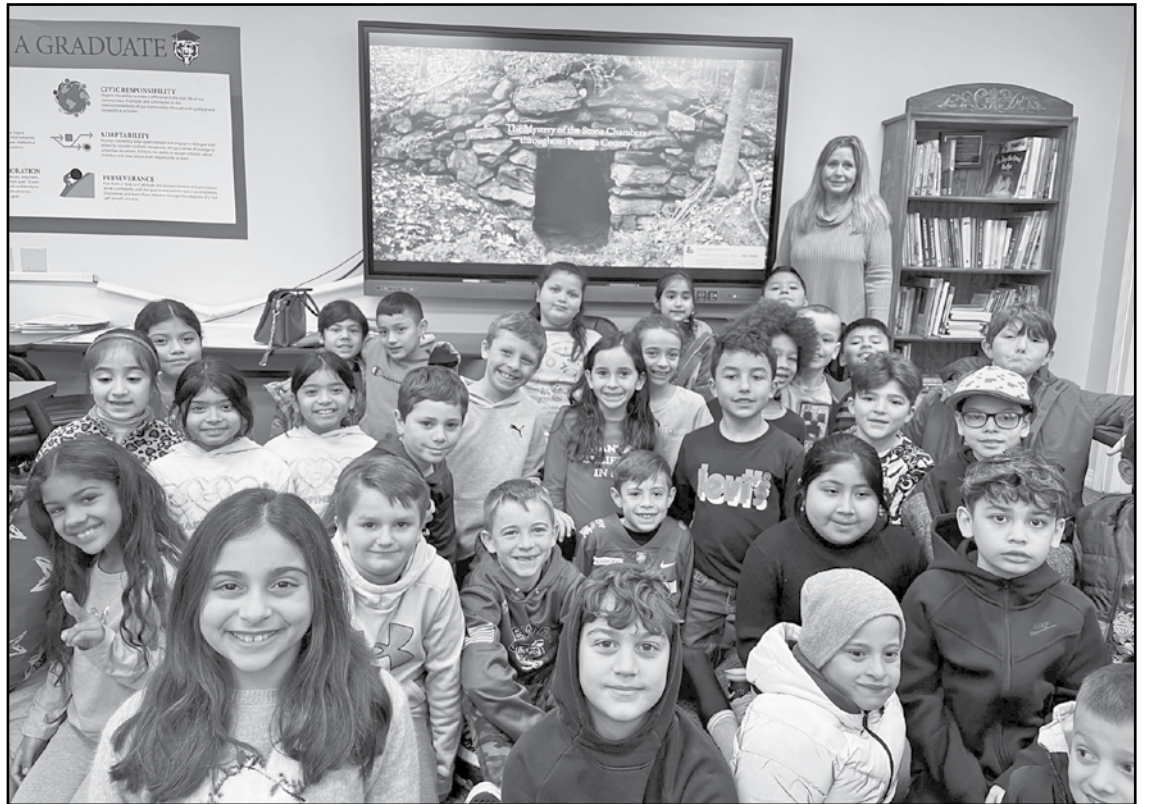
Third-graders in Brewster recently learned about the mysterious stone chambers of Putnam County.

GAC is a 501(c)3 not-for-profit arts and education organization founded in 1964 that is committed to making a difference by providing access to the visual arts to a diverse audience of learners, professional artists, community members, collectors, families and friends from varied ethnic, cultural, geographic and economic backgrounds. For information about exhibitions, classes and other programs at GAC, visit garrisonartcenter.org or call 845-424-3960.