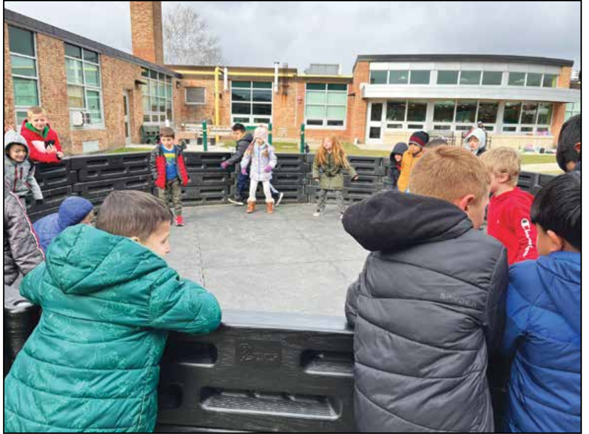
Brewster students take turns in the Gaga pit at JFK Elementary School.

Patterson Library's Teen Leadership Council recently wrapped up its annual children's coat drive by collecting 38 new children's coats that were donated to the Putnam Community Action Partnership for distribution to local families.