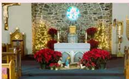
Our Lady of the Lake/Mt. Carmel 1 Doherty Drive, Carmel, NY 10512