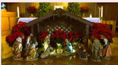
St. James the Apostle Church 14 Gleneida Avenue, Carmel, NY 10512

Religious Education: religioused.stjamesapostle.org