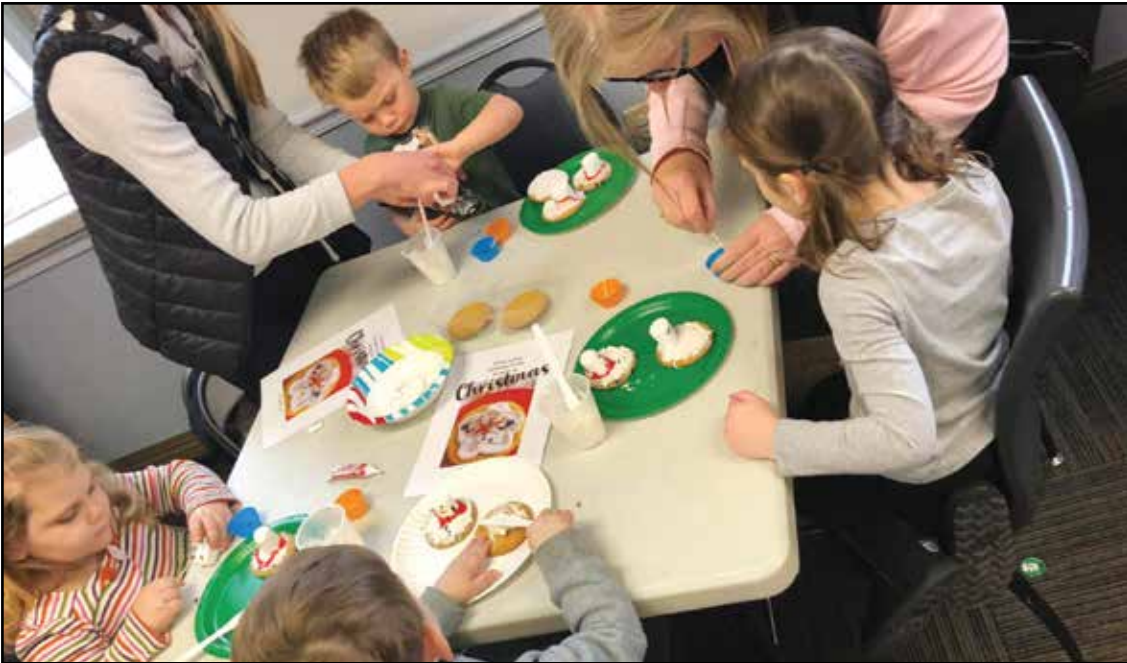
Youngsters got in the holiday spirit recently by making snowman cookies at Kent Public Library.